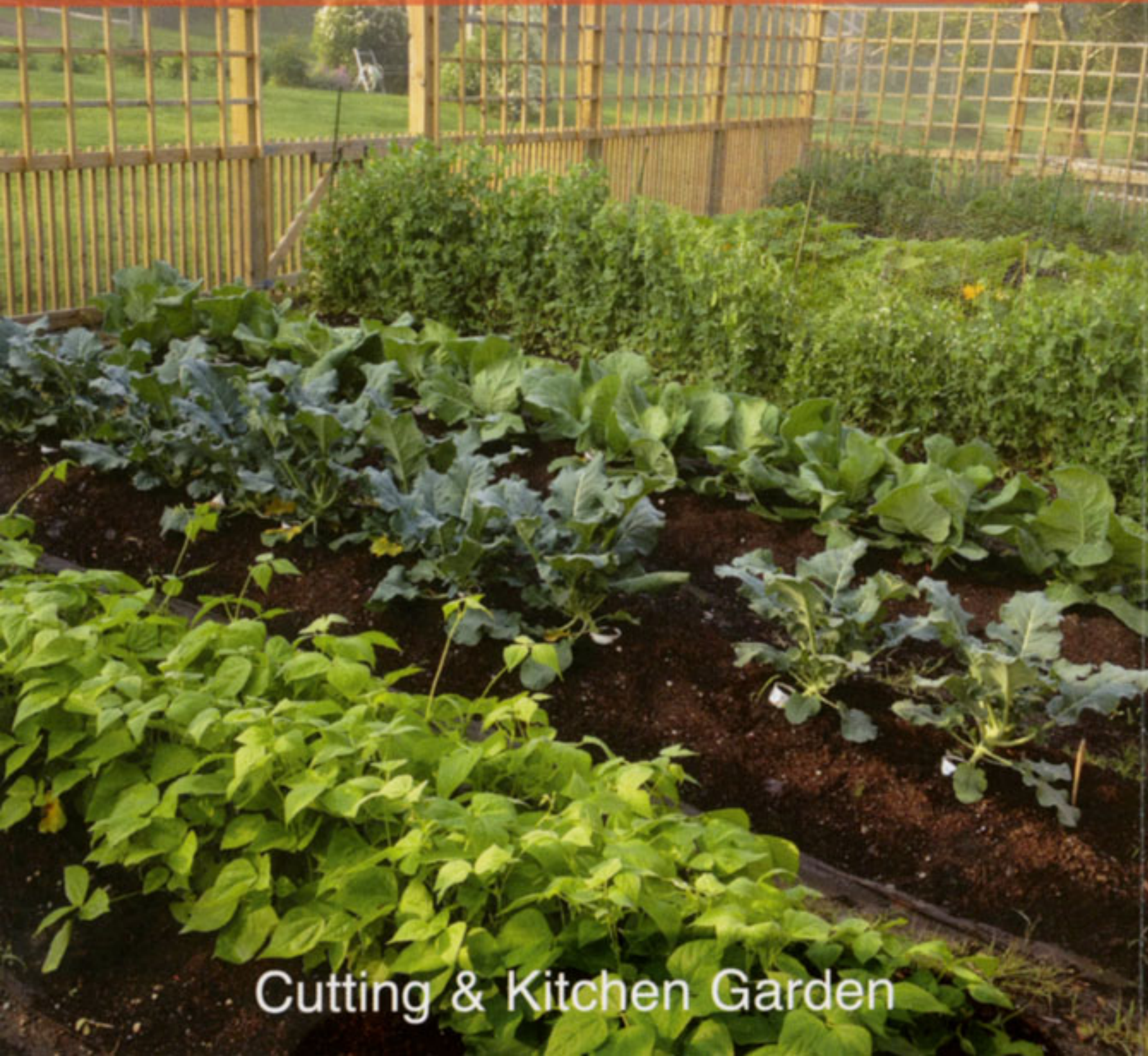
Cutting & Kitchen Garden

Dene Farm, at the lower level of the estate, is home to a teaching greenhouse, pollinator and songbird sanctuaries and a 600' floating boardwalk over our Batten Kill wetland.